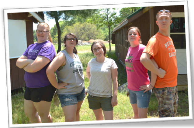
Taking a quick break to pose in between cleaning cabins!

After we get done cleaning on Saturday, we will head to Pizza Ranch for dinner and end the night with some bowling! So grab your gear, come ready to eat lots of pizza, and prepare to have a great end to our first week!